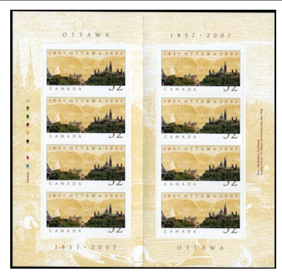
2 x 2214a (BK350)