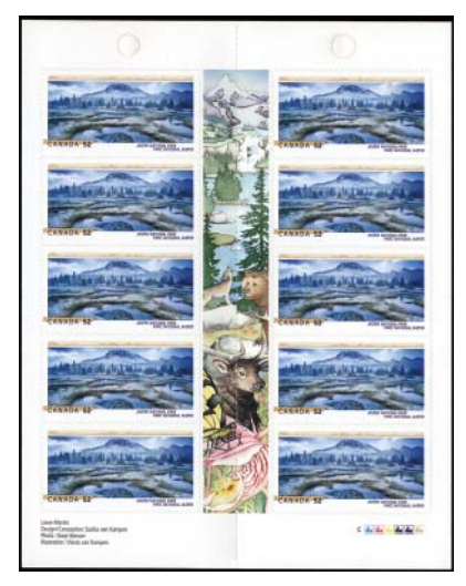
2 x 2224a (BK356)

100th anniversary of Jasper National Park, Alberta. The illustration at the top of the stamp depicts the park's horizon. The top band of tagging also includes the park's horizon line with a mirror image appearing in the bottom band of tagging.