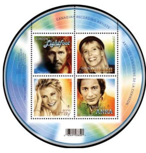
2221 Souvenir sheet

For non-denominated postal cards of same designs, see UX176–UX179.