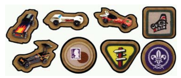
Self-adhesive seals supplied in Scouting booklet.