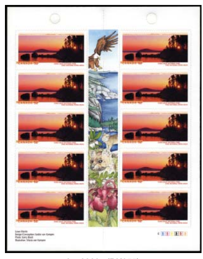
2 x 2223a (BK355)

50th anniversary of Terra Nova National Park, Newfoundland. The illustration at the top of the stamp depicts the park's horizon. The top band of tagging also includes the park's horizon line with a mirror image appearing in the bottom band of tagging.