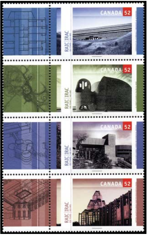
2215 University of Lethbridge (Lethbridge, AB) by Arthur Erickson