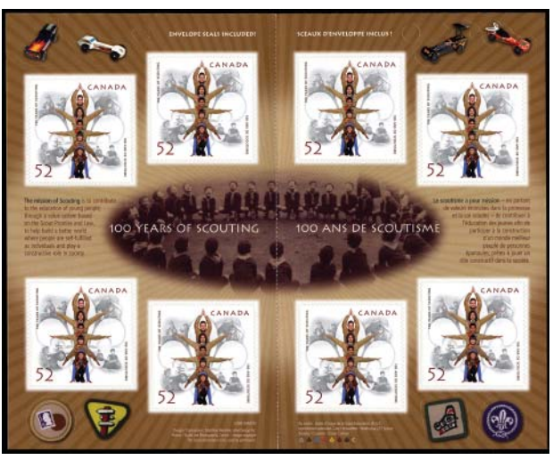
2 x 2225a (BK357)