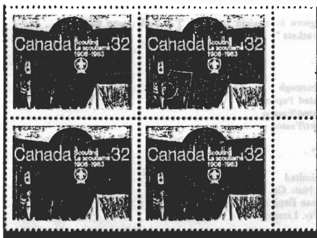
Scouting #993 "Backpack" UR (Due to foreign matter on plate) by: David Schmit