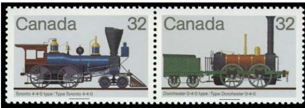
999 Toronto 4-4-0 type