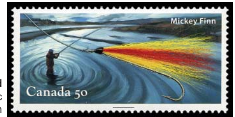
2087d Mickey Finn, for Atlantic Salmon