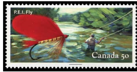
2087c P.E.I. Fly, for Brook Trout