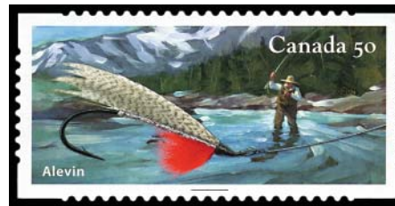
2088a Alevin, for Rainbow Trout