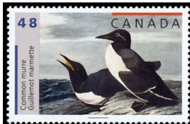
1982 Common murre