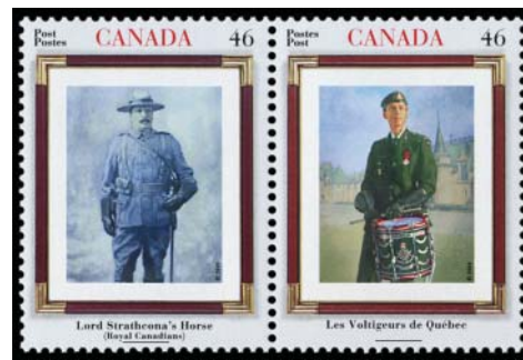
1876 Lord Strathcona's Horse 1877 Les voltigeurs de Québec