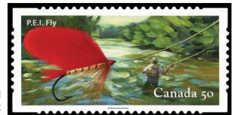
2088d P.E.I. Fly, for Brook Trout