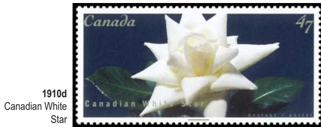
1910d Canadian White Star