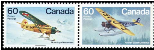
971 Noorduyn Norseman