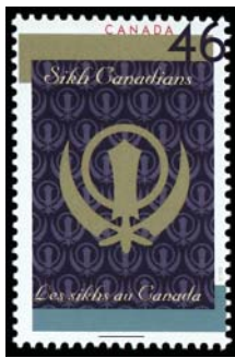
1786 The Khanda