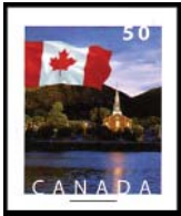
2079 Flag over Mont Saint-Hilaire, QC