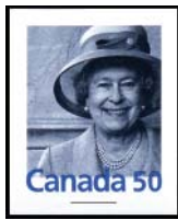
2075 Queen Elizabeth II