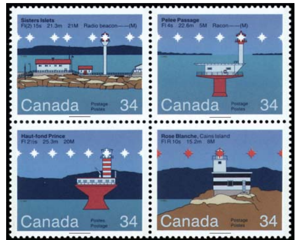
1065 Haut-fond Prince