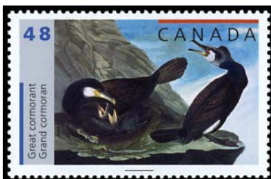
1981 Great cormorant