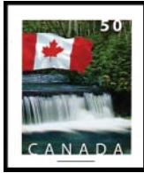
2078 Flag over Shannon Falls, Squamish, BC