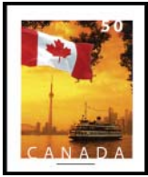
2080 Flag over Toronto, ON Island Ferry