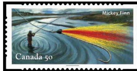
2088c Mickey Finn, for Atlantic Salmon