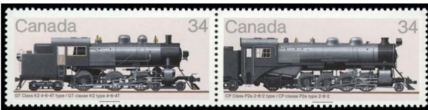
1071 GT Class K2 4-6-4T type