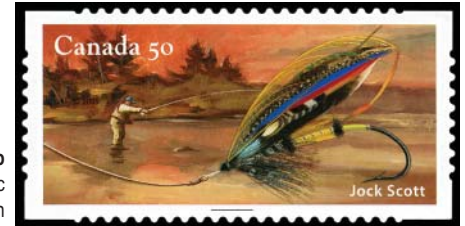
2088b Jock Scott, for Atlantic Salmon