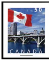
2076 Flag over Broadway Bridge, Saskatoon, SK